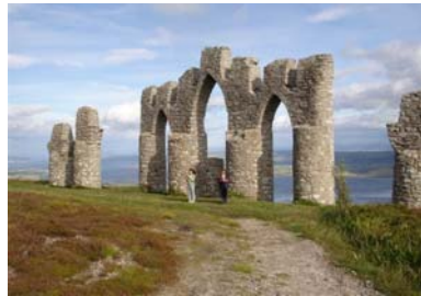
The Fyrish Monument