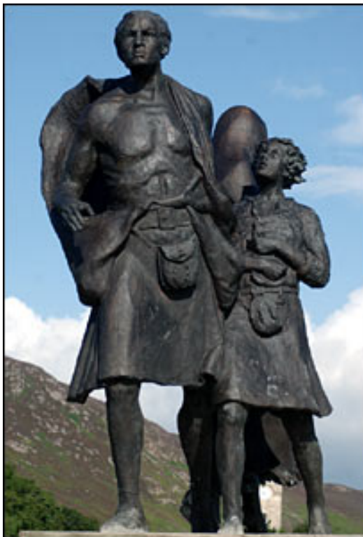
Exiles statue at Helmsdale in Sutherland

A memorial statue to those affected by the Highland clearances has been officially unveiled. We all know of the clearances and now two statues to commemorate this sad part of Scotland's past with the promise of more in the countries our ancestors settled – maybe one in Australia?