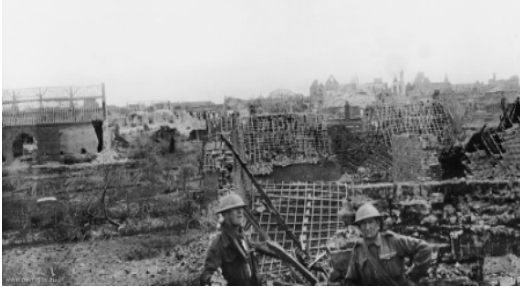
Shattered buildings in the French village of Lagnicourt, which was captured by the Australians in late March 1917 as the Germans withdrew towards the Hindenburg Line. The Germans heavily shelled the village as they retreated.

The Australian War Memorial website notes that the 58th Battalion was raised in Egypt on 17 February 1916 as part of the expansion of the AIF. Roughly half of its recruits were Gallipoli veterans from the 6th Battalion and the other half were fresh reinforcements from Australia. Reflecting the composition of the 6th, the 58th was predominantly composed of men from Victoria. The Battalion became part of the 15th Brigade of the 5th Australian Division.